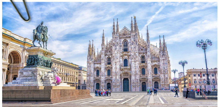
Milano Duomo & Plaza