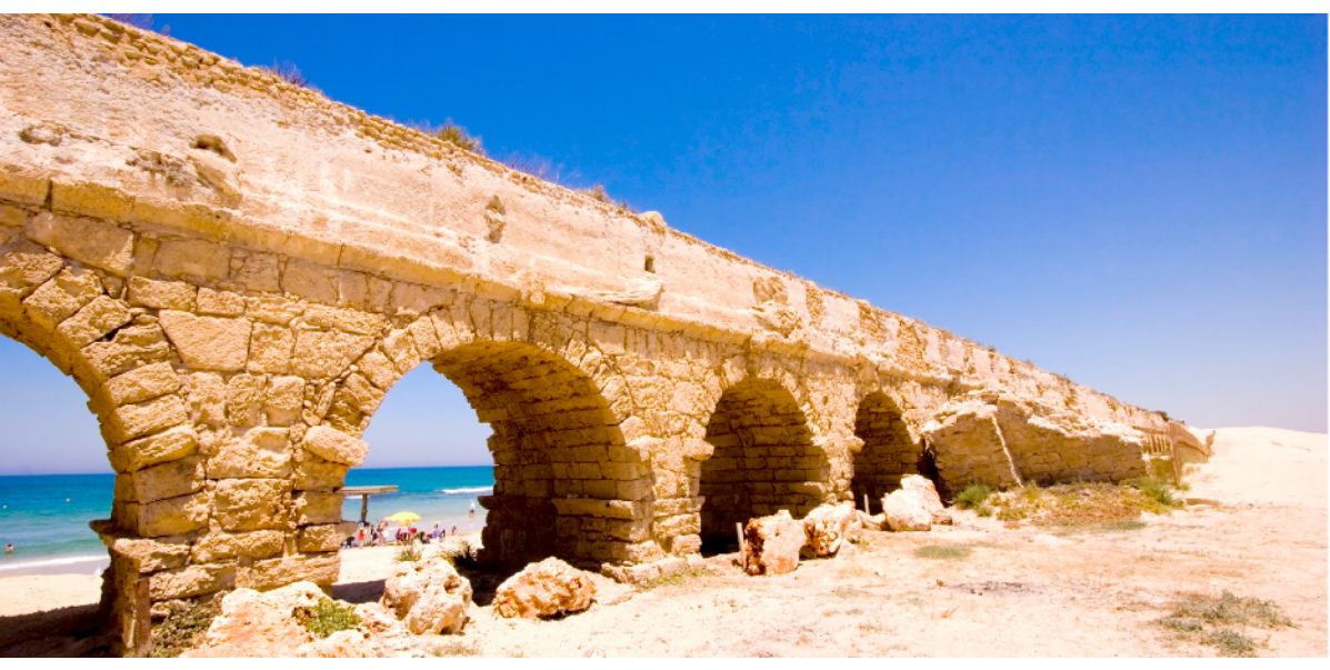
JERUSALEM'S DOME OF THE ROCK AND WESTERN WALL, ABOVE, AND AN AQUEDUCT IN CAESAREA

Tel Aviv Caesarea Nazareth Sea of Galilee Capernaum River Jordan Jerusalem Bethlehem Dead Sea Qumran