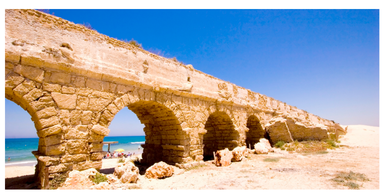
JERUSALEM'S DOME OF THE ROCK AND WESTERN WALL, ABOVE, AND AN AQUEDUCT IN CAESAREA

Tel Aviv Caesarea Nazareth Sea of Galilee Capernaum River Jordan Jerusalem Bethlehem Dead Sea Qumran