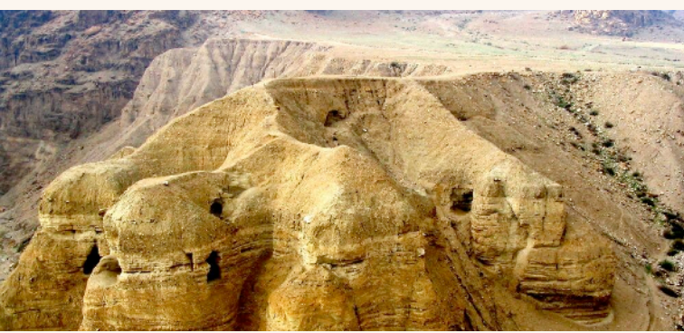
THE DEAD SEA QUMRAN