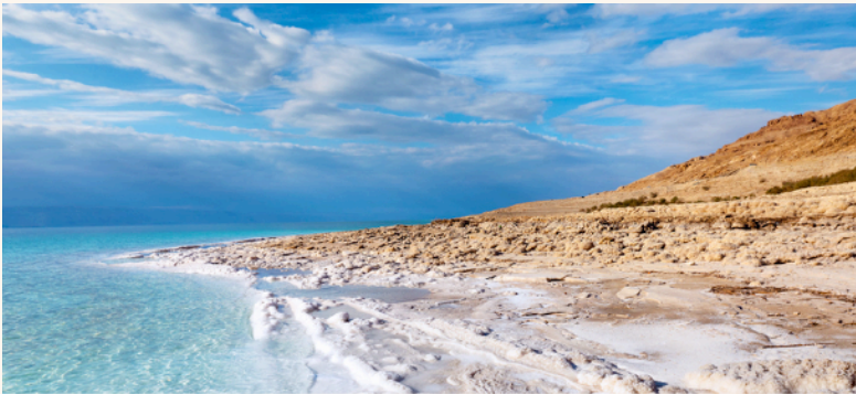
THE DEAD SEA

walk through the remains of the palace, water cisterns and fortifications built by King Herod and hear about the Zealots who lived here until the bitter end. There is a food court at Masada where we will have lunch. Bring a swim suit if you want to float on the Dead Sea. We will celebrate our tour with a group dinner at our hotel restaurant at 6pm. [B,L,$20,D]