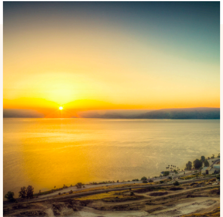
SUNRISE OVER THE SEA OF GALILEE, WHERE YOU WILL ENJOY A RELAXING BOAT RIDE OFFERING TIME TO PONDER THE STORIES OF JESUS CALLING FISHERMEN TO FOLLOW HIM, PREACHING FROM A BOAT, AND CALMING THE STORMY WAVES.

We load our coach and drive to Caesarea, built by Herod the Great in honor of Augustus Caesar, and considered the traditional site of Paul's imprisonment before his trial in Rome. We have lunch at a Druze village restaurant. After a tasty lunch, we ascend Mt. Carmel, where we enjoy a great view of the Jezreel Valley. We read from scripture about Elijah. We will also read from Luke about the miracles and ministry of Jesus. We check into our hotel, freshen up, and enjoy a traditional Israeli dinner in the hotel restaurant. [B,L$20,D]