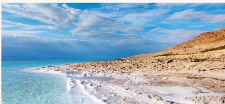
THE DEAD SEA

At 8am, our coach-driver will take us to the Dead Sea Basin where we will visit Qumran to explore the area where the Dead Sea sect established a community and we'll see the caves where the Dead Sea Scrolls were found. We'll drive to Masada and ascend this wilderness mountain fortress in a cable car; walk through the remains of the palace, water cisterns and fortifications built by King Herod and hear about the Zealots who lived here until the bitter end. There is a food court at Masada where we will have lunch. Bring a swim suit if you want to float on the Dead Sea. We will celebrate our tour with a group dinner at our hotel restaurant at 6pm. [B,L,$20,D]