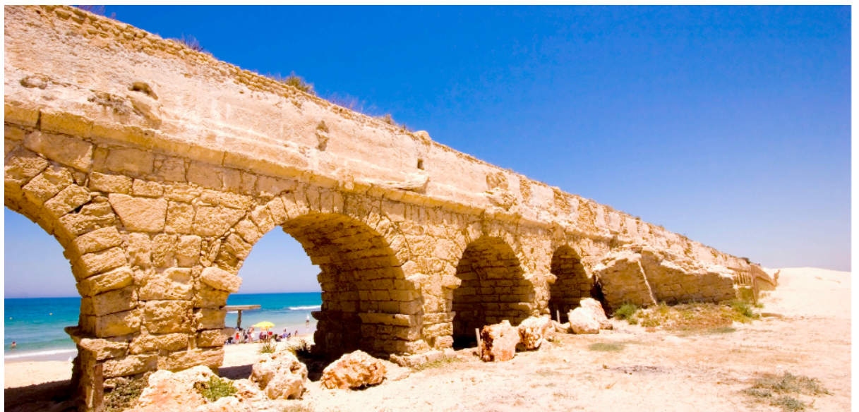
JERUSALEM'S DOME OF THE ROCK AND WESTERN WALL, ABOVE, AND AN AQUEDUCT IN CAESAREA

Tel Aviv Caesarea Nazareth Sea of Galilee Capernaum River Jordan Jerusalem Bethlehem Dead Sea Qumran