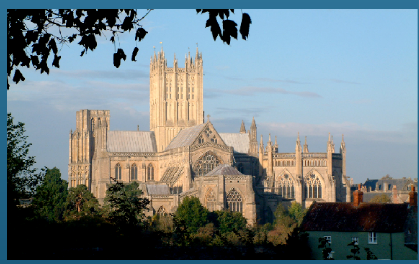
Wells Cathedral, Somerset