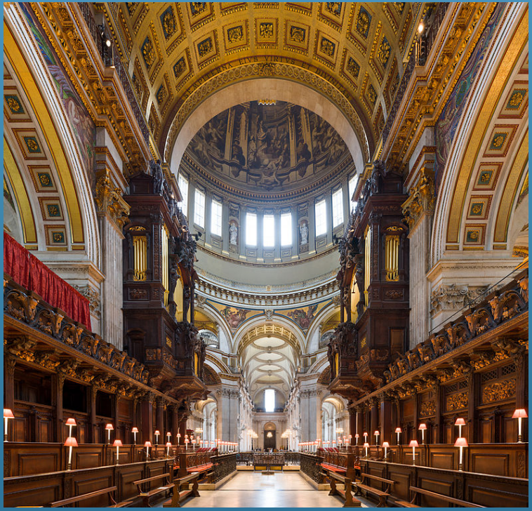
The Quire of St. Paul's Cathedral