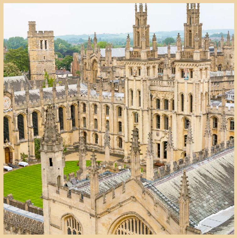
Christ Church Cathedral, Oxford