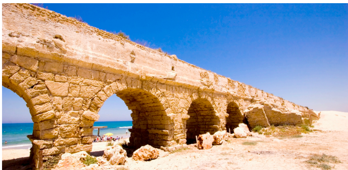
JERUSALEM'S DOME OF THE ROCK AND WESTERN WALL, ABOVE, AND AN AQUEDUCT IN CAESAREA