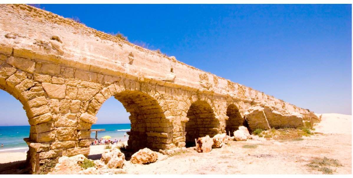
JERUSALEM'S DOME OF THE ROCK AND WESTERN WALL, ABOVE, AND AN AQUEDUCT IN CAESAREA

Petra Mt. Nebo Caesarea Nazareth Sea of Galilee Capernaum River Jordan Mt. of Olives Jerusalem Bethlehem Dead Sea Qumran