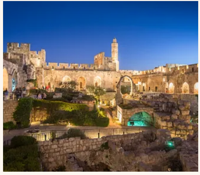
TOWER OF DAVID MUSEUM NEXT TO OUR HOTEL IN JERUSALEM

We tour the Israeli Museum from 9 AM - 1 PM In the afternoon we will enjoy a little free time to shop in the Holy City. Walk through the narrow streets at your own pace and take in the various sounds and smells. You might also want to explore the City of David excavation site today as well, or the Davidson Center. [B,D]