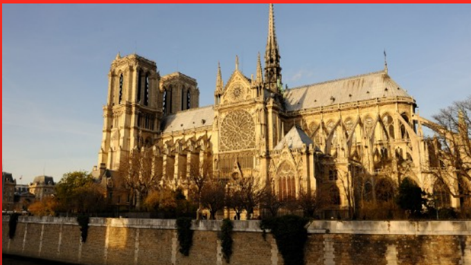
Notre Dame Cathedral, Paris

Enjoy Ghent at leisure this morning. Orgiano Duo will offer an afternoon concert at a local venue. After the concert, you are welcome to enjoy this beautiful city at your leisure. Make sure to check-out the historic Ghent altar piece in Sint Bavo Cathedral. [B]