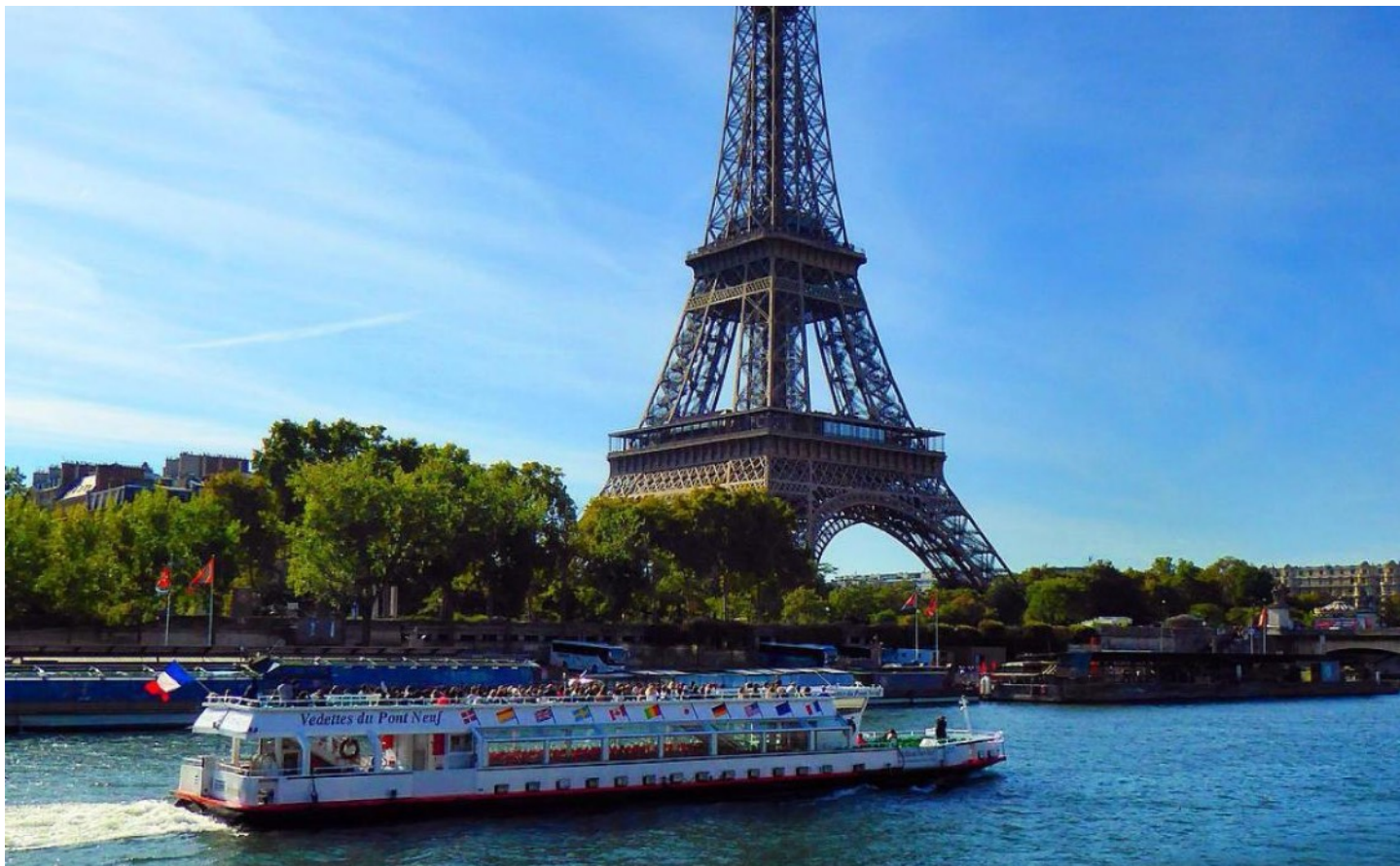
Eiffel Tower, Paris