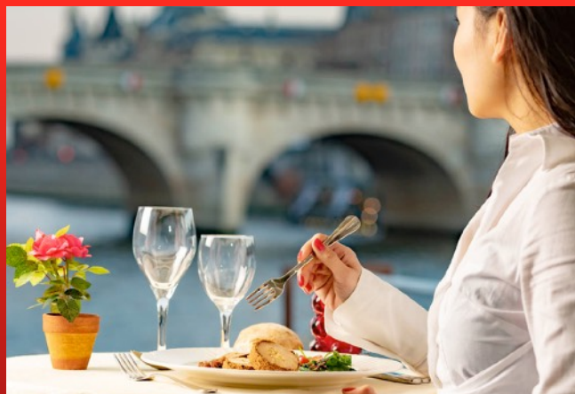
Dining with a View, Paris