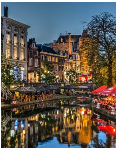
Canal and Restaurants, Amsterdam