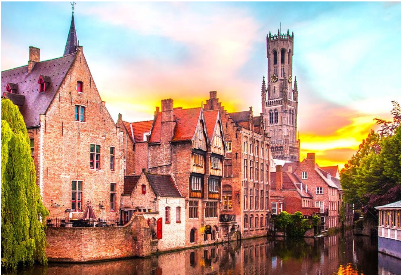
Canal and Bell Tower, Bruges