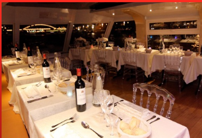
Boat Restaurant, Paris

Orgiano Duo will offer a concert at a local venue today. After the concert we gather at a bar for some local flavors, but we go 'dutch' on food and drinks. The evening is at your leisure. Be sure to check out some of the many museum options in your free time such as the Groeningemuseum, Bell Tower, Torture museum, or the Dali museum. [B]