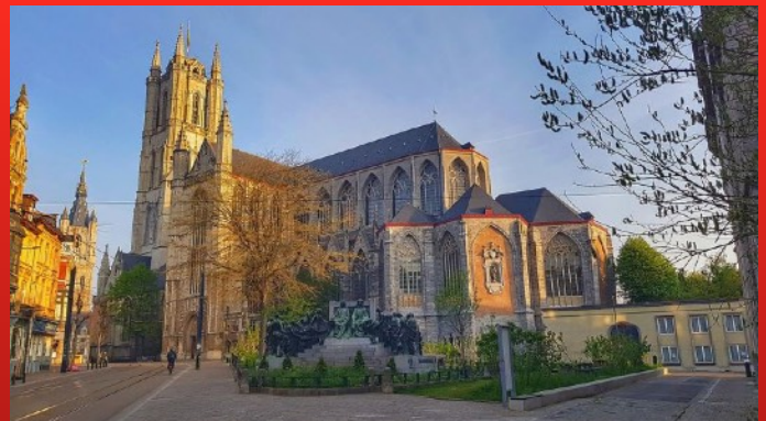
St. Bavo Cathedral, Ghent