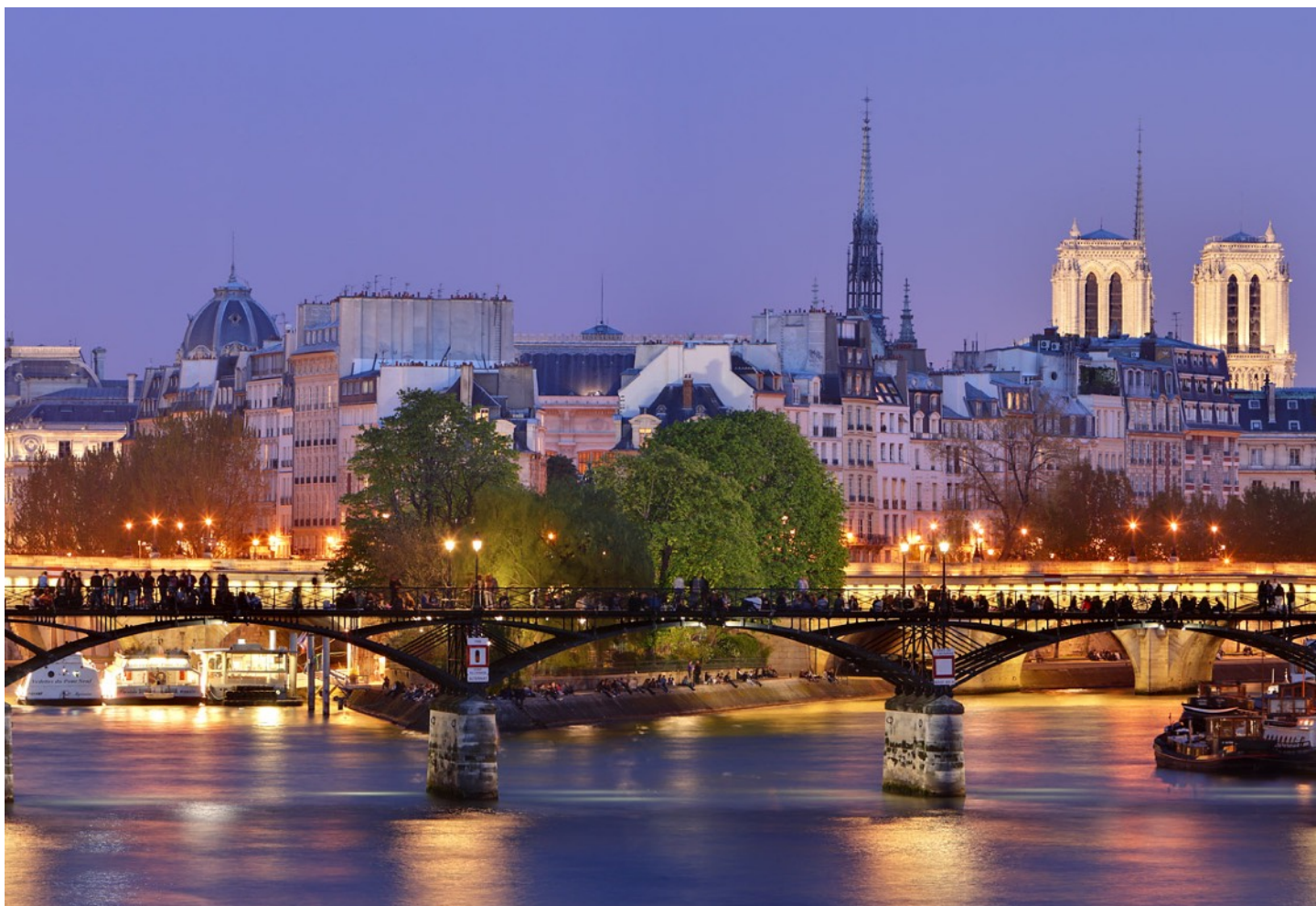
The Seine, Paris