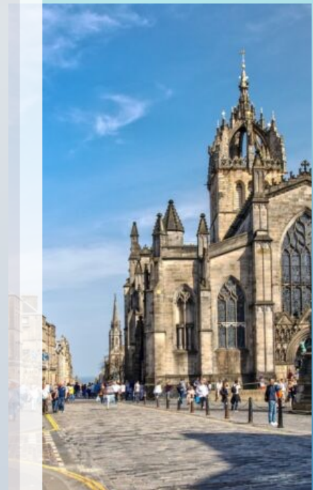
St. Giles Cathedral