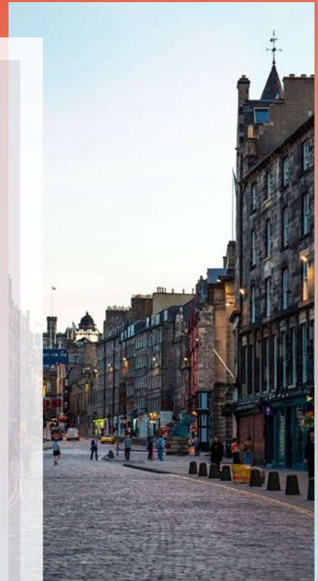
Royal Mile, Edinburgh

Enjoy a free day in Edinburgh. This evening we join together for dinner and a show that celebrates Sottish traditions. Tomorrow morning we bid farewell to Edinburgh, and depart for St. Andrews so please pack and plan accordingly. [B,D]