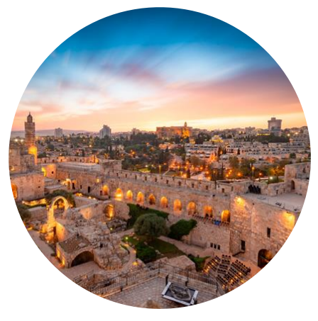
Saturday, Nov. 5

We head to the low lands of Judea and visit Emmaus , where Jesus appeared to two disciples following his resurrection. We continue to the archeological and Biblical town of Tel Gezer , where we will peel back history. We continue our excursion to Old Testament town of Tel Lachish. [B,L]